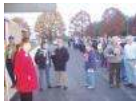
South Annville voters wait their turns outside the township's new polling place, Zion Evangelical Congregational Church on Route 934 south of Annville-Cleona High School. The change was made in anticipation of a big crowd, which would have created a road hazard at the township building in Fontana.

At 7AM, approximately 40 people waited in line to vote. Clearly more than 17 parking spaces are needed to accommodate this volume of voters. Starting in 2009, construction of 571 new homes will require even more parking.